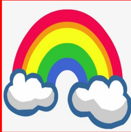
Autumn 2 - Colours