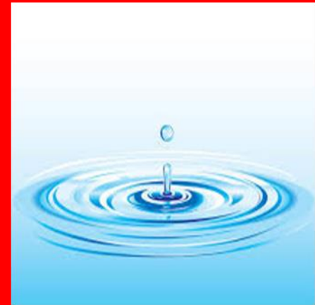
Summer 2 - Water