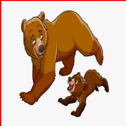
Spring 2 - Bears