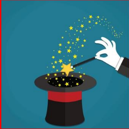
Autumn 1 – Magical Me