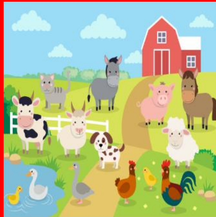
Summer 1 – The farm