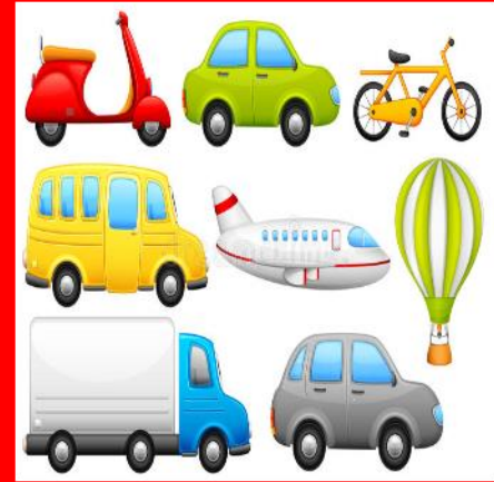
Spring 1 - Transport