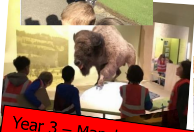
Year 3 – Manchester Museum