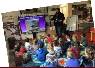
EYFS – Visitors and Exploring