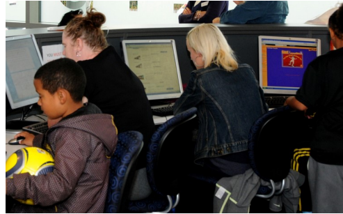
You can access computers at your local library.

You should apply for at least 3 schools. If you only put one or two, you could have little choice about where your child goes.