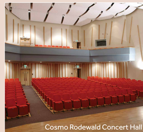
Cosmo Rodewald Concert Hall

There is seating in the main foyer and baby changing facilities available.