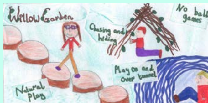
Misha Rhodes 5PS