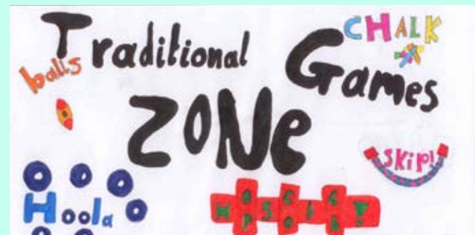
Leila Bury 5CD