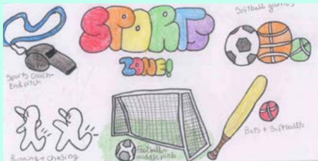
Amna Rashid 4SM

The children have helped us to design banners to show what each zone is for. You can see the amazing designs they came up with below!